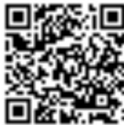
Official Notice Board

Scan this QR-Code with your device to access the Official Notice Board (ONB)